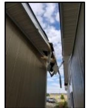
Backing house and hit other house at consignee

When backing, don't assume or rely on others to judge your space.