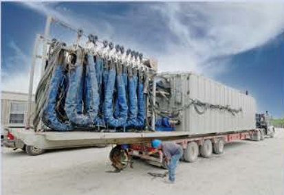
Heavy Haul Trucks/Trailers